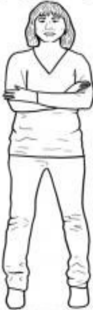
Illustration: Illustration by Lynn Stover Illustration of the long-sleeved top, pants, and shoes are all original work by Lynn Stover. Illustration of the woman's face is a composite of several women's faces. Illustration of the woman's hair is a composite of several women's hair styles. Illustration of the woman's hands is a composite of several women's hands. Illustration of the woman's feet is a composite of several women's feet. © Lynn Stover 2020. All rights reserved.