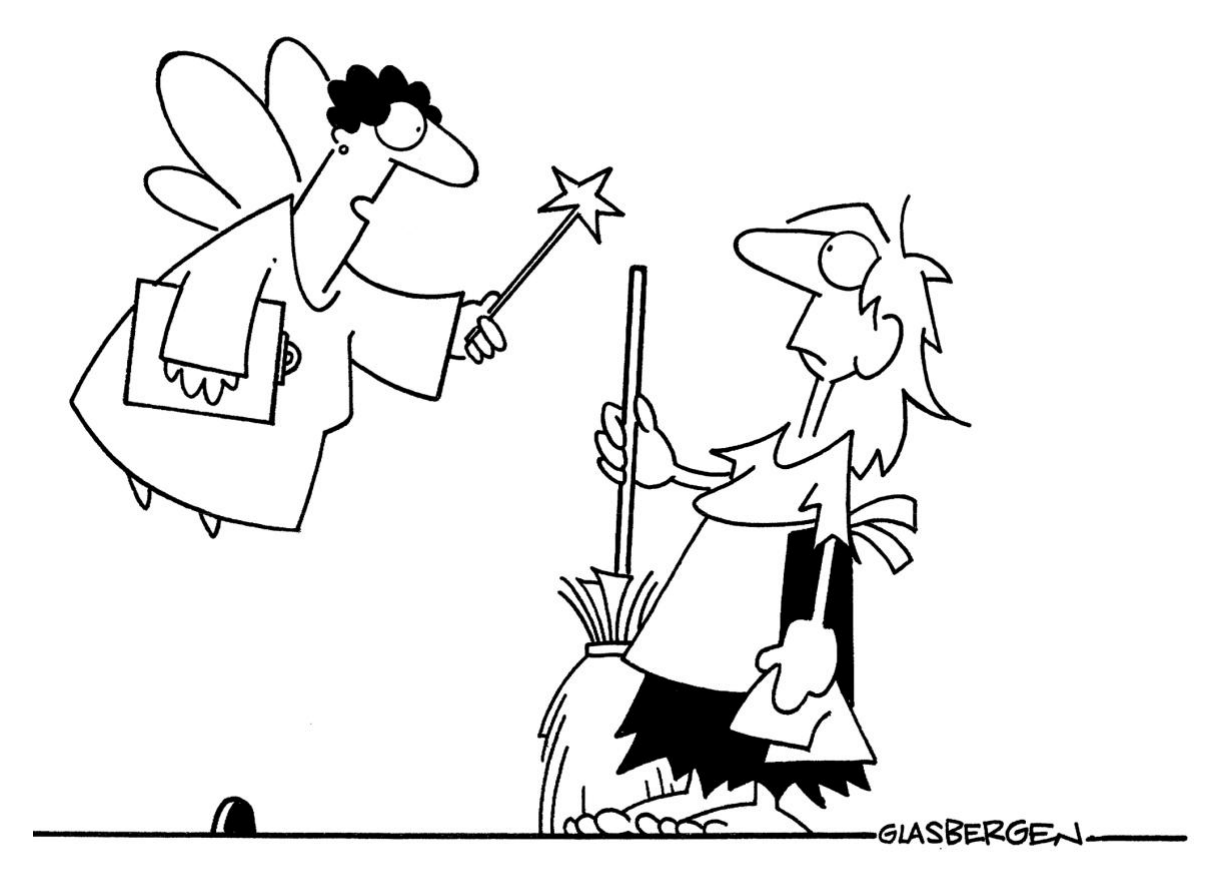
"After federal, state, and local taxes, you get one-third of a wish."