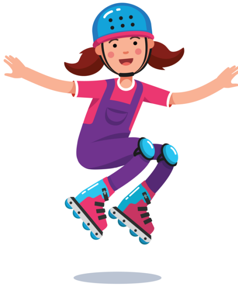
Trying Out New Roller Skates