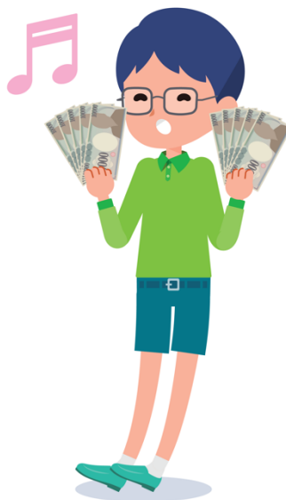
Buying a Lollipop