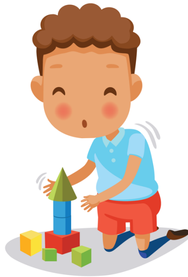
Playing With Toys