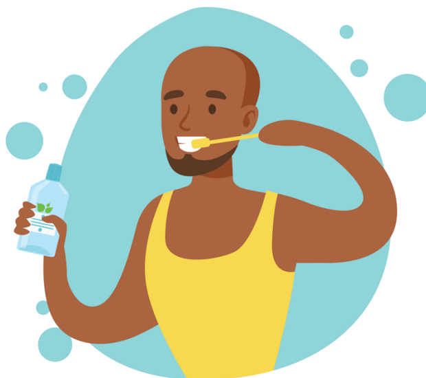
Using a New Toothbrush