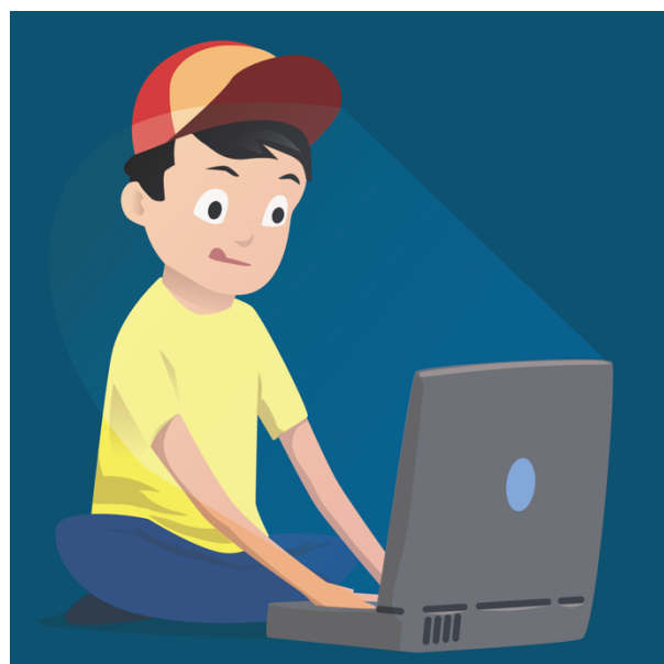
Playing a Computer Game