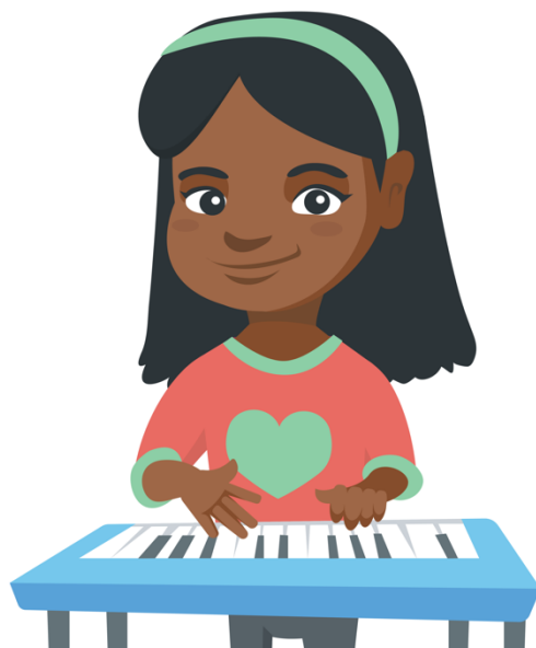
Playing the Piano