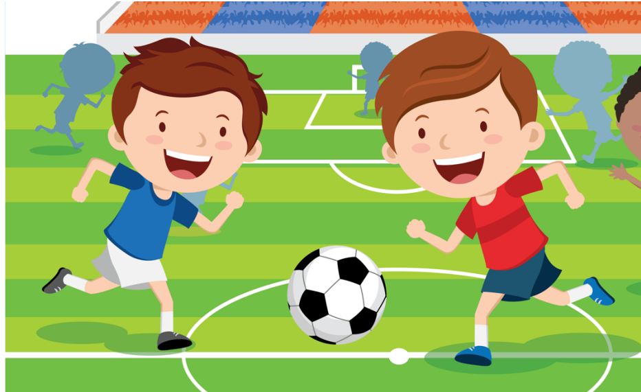
Using Sports Equipment